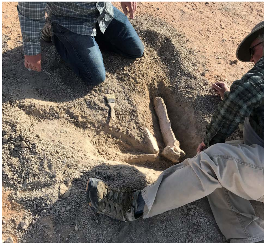
Figure 4. One of the vertebra exposed. This vertebra is from the hump on the back of an extinct form of bison.