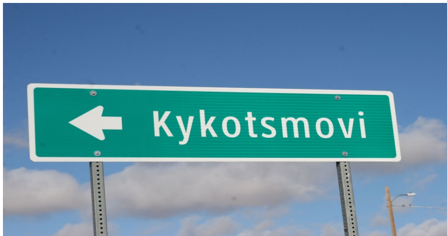
Figure 5. This sign points to the location of Kykotsmovi village.

The Hopi Cultural Resources Advisory Task Team is composed of representatives from all of the Hopi villages, and a number of prominent clans, priesthoods, and religious societies. These members are experts in Hopi culture and possess important information regarding cultural resources.