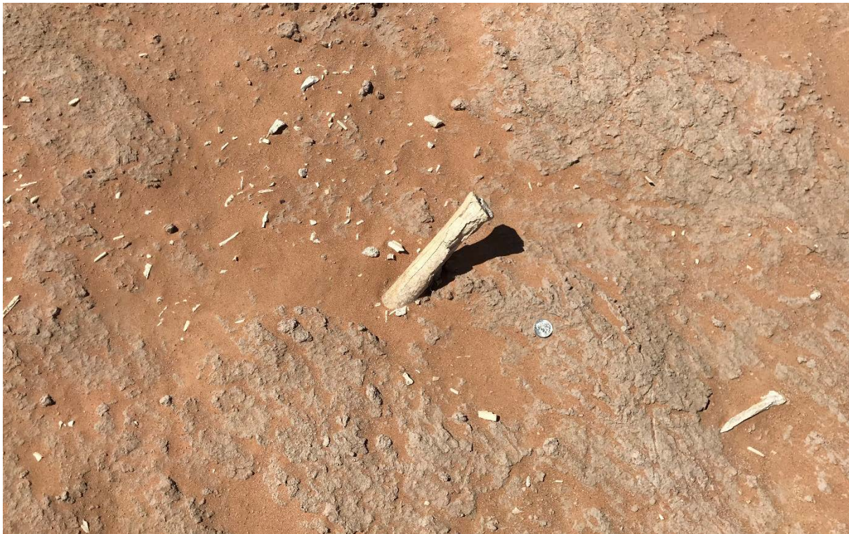
Figure 2. A bone protrudes from a gray playa matrix in this photograph. A quarter for scale is nearby. Eroded bone fragments can also be seen surrounding the protruding bone.

Some of the extinct animals coexisted with humans in the latter part of the Pleistocene and they are of interest to archeologists as clues to sites that have evidence for these early occupations. The first evidence for this was found in 1927 near Folsom, New Mexico, where bones of an extinct form of bison were found with a distinctive lanceolate spear point, later called the Folsom point. This find was followed by excavations in Burnet Cave in the Guadalupe Mountains of Eddy County in 1930, where a lanceolate point was found in association with several species of extinct animals. Archeologist E.B. Howard excavated Burnet Cave and upon its completion in 1932 shifted his research to the Blackwater Draw site near Clovis, New Mexico. There he continued to find man-made artifacts associated with extinct animal bones, including a distinctive lanceolate spear point, called the Clovis point, found with mammoth bones. This find placed humans at that locality at around 12,000 B.C. when mammoth were still part of the North American fauna. Archeologists have returned to the Blackwater Draw site through the years and currently a portion of that locality is managed by Eastern New Mexico University for research and as an exhibit, with an archeological excavation, that is open to the public.