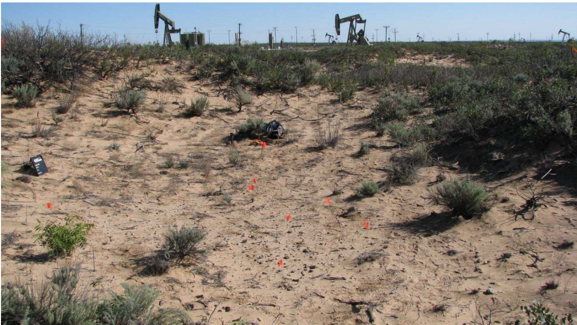
Figure 3. Overview of LA 190144 looking north. This was a previously unrecorded site discovered during the survey.

Less than 0.05 ac of eligible site area was impacted (Graves et al 2018:136-137).