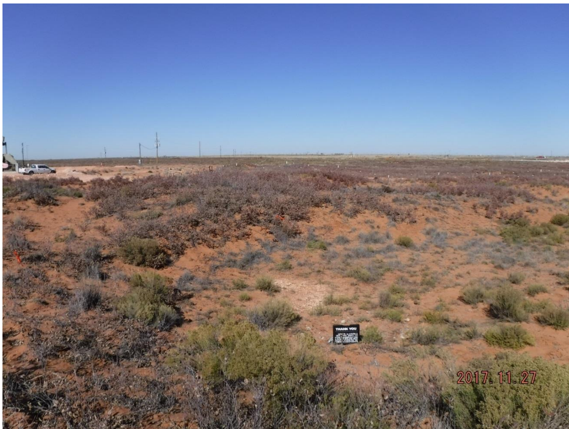
Figure 2. Overview of LA 176300 looking north. This site was monitored during construction of the well pad that is in the upper left corner of the photograph.

There are quirks in using the PA that mostly involve land ownership. The PA area includes BLM surface managed land, but there are checkerboard localities that include New Mexico SLO and private property. Since PA projects cannot be approved on SLO land, applicants for pipeline projects that cross from BLM to SLO land have to arrange for archaeological surveys of the state property. The same is true for well pads that are located on SLO property but that have BLM minerals. Since use of the PA is voluntary, there are still archaeological surveys being completed within the PA area for projects that are eligible but not submitted for PA review by the proponents.